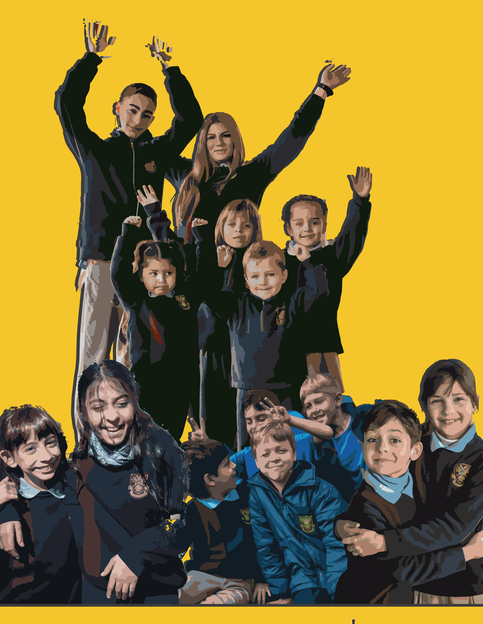
We Don't Just Teach, We Educate!